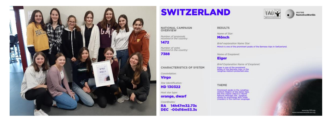
Class L3a Cantonal School Menzingen, the winners of the naming Mönch and Eiger

As was announced in the last newsletter of December 2019, Eiger and Mönch are now immortalized in the constellation Jungfrau at the firmament. In the meantime, the certificates of the IAU have arrived.